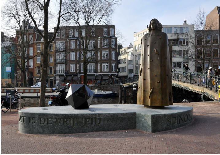
Spinoza monument in Amsterdam

Hirschhorn has already built three monuments in this series dedicated to intellectuals he admires. One in Amsterdam in 1999 dedicated to Baruch Spinoza ; another in 2000 in Avignon to honour Gilles Deleuze ; and a third in Kassel in 2002 to celebrate Georges Bataille .